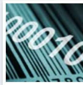
Stock Control System